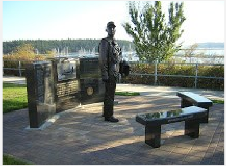
Whidbey Patron Squadron Memorial